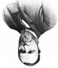
This man remembered you in his will.

WINTER WAS MADE FOR WARM BLANKETS & LARGE BOOKS! jvbrown.edu Book donations are accepted. Please consider supporting the Friends as a member. FRIENDS OF THE JVB LIBRARY BOOKSTORE HOURS: Mon, Fri, & Sat: 10:30 am-1:30 pm, Tues & Wed: 1:30 pm-4:30 pm, Thurs & Sun: Closed